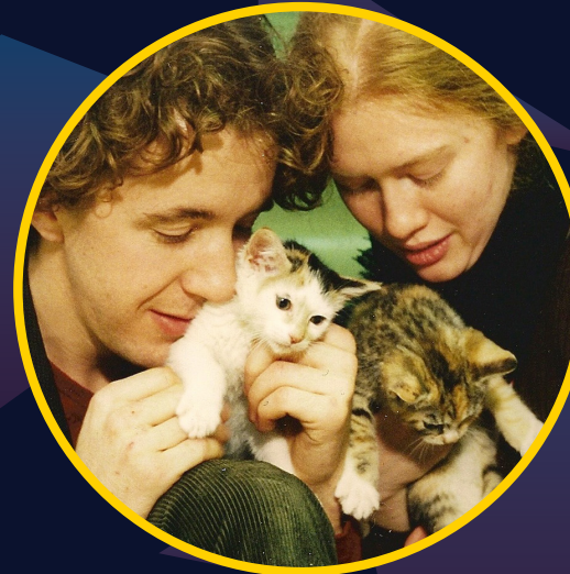
1966 Westhampton Adoption Center Opens