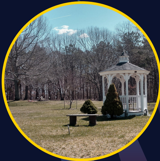
1958 Westhampton Pet Memorial Park Opens