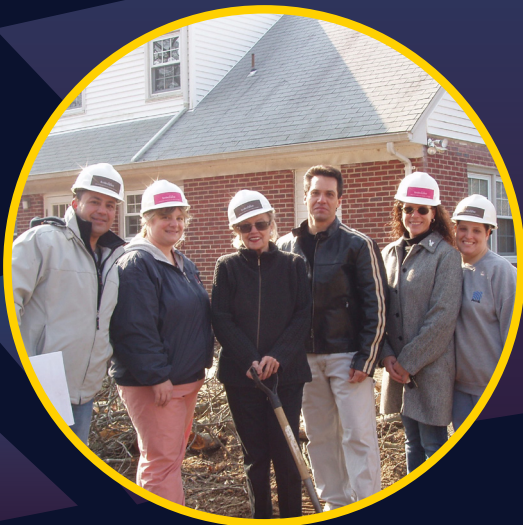
1976 Westhampton Animal Hospital Completed