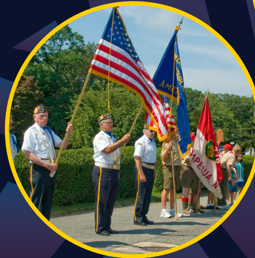
1983 Bideawee launches first annual Pet Memorial Day in Wantagh