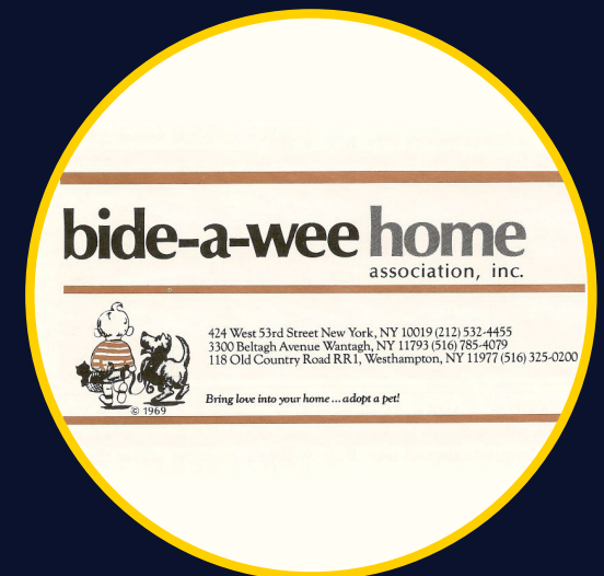
1969 First Consistent Brand Identify Introduced