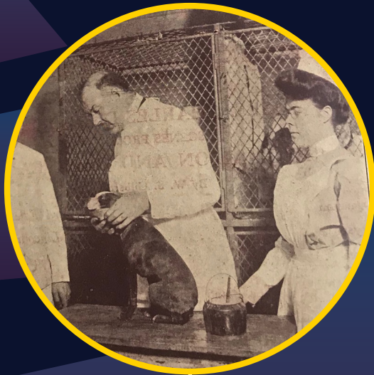
1940 Animal Healthcare First Practiced at Bideawee