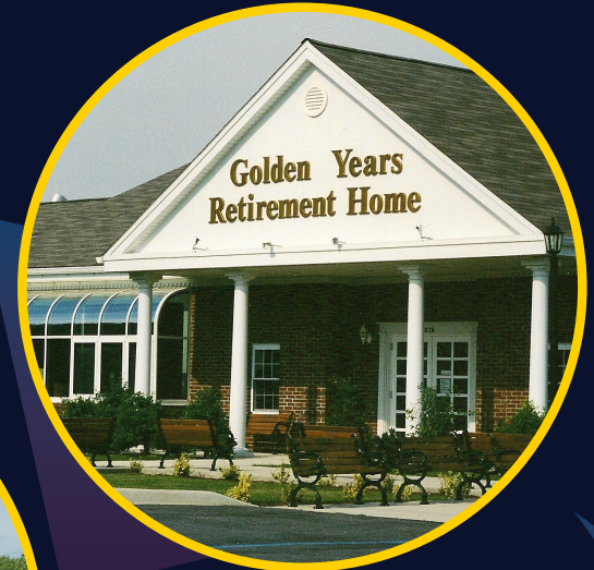
1999 Westhampton Pet Retirement Home Established