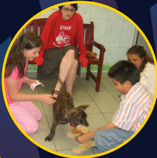
1982 Bideawee Pet Therapy Program Launched